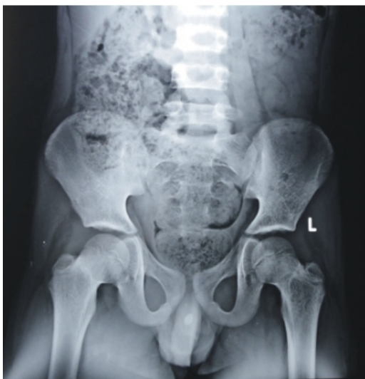
Figure1. Radiograph shows the impacted calculus in anterior urethra.

In short, the appropriate size curved urethral bougie fitted snugly with plastic tube with its proximal bevelled end projecting over the end of bougie about half inch and the same introduced into the urethra which help in dislodgement of stone back in to the bladder (Fig.2).