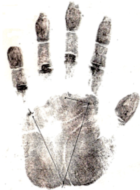
Figure 2 - Dermatoglyphic palmar patterns