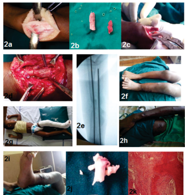
Fig 2: Surgical procedure of resection of pseudoarthrosis and intramedullary fixation with allogeneous cancellous bone graft. Fig 2a- Intraoperative finding of fibrous tissue around dysplastic tibial ends at site of pseudoarthrosis of tibia; Fig 2b- Allogeneous Cancellous bone graft from child's father's Iliac crest; Fig 2c- Retrograde fixation of graft to resected tibia with a k-wire; Fig 2d- Intraop picture of allogeneous graft fixation with k-wires passed retrogradely; Fig 2e- C-arm picture showing correction of deformity with fixation of graft insitu; Fig 2f- Post operative picture showing deformity correction without limb length discrepancy by ensuing allograft sizing the resected specimen of tibia; Fig 2g- post operative splinting in above knee cast; Fig 2h- Clinical picture of parent with neurocutaneous lesions over the body showing surgical scar from iliac crest over allograft donation site; Fig 2i- Post-operative healed surgical scar with k-wires insitu; Fig 2j- resected gross specimen of sclerotic and dysplastic tibial ends over pseudoarthrosis site; Fig 2k- Histopathology slide of excised tissue show cellular proliferating fibrous tissue with immature bone is observed, 40 × resolution.

The child was initially planned for excision of fibrosis and dysplastic ends of tibia and fixation. The abnormal part of tibia – dysplastic bony fractured ends and fibrous tissue was resected leaving a gap of 5cm. A thick allogeneous cancellous strut graft from the iliac crest of the child's father after due major cross matching the blood group was taken. The bone gap was reconstructed by passing a 1.5mm K-wire of 30cm length in a retrograde manner under c- arm guidance from distal tibia through talus, calcaneum to heel. A 1mm k wire is passed to fix the fibula after resecting the fibrous tissue and freshening the edges to provide internal splintage to the leg. The deformity was clinically corrected and there was no limb length discrepancy without neurovascular compromise. Post operatively child was immobilised in a above knee plaster cast. Suture removal was done after healing of surgical wound and there was no signs of infection. [Fig 2] Child was followed for up to 3 months, with check radiographs taken every monthly and there was no clinical signs of infection on inspection after removing cast. At the end of 3 months, there was no signs of bony union and the allogeneous cancellous graft was sclerotic. [Fig 3]