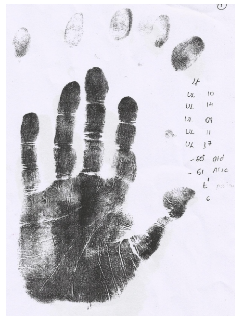
Fig No 3: Palmar pattern, Finger tip pattern & atd angle

One hand of the subject was then placed on the sheet of paper from proximal to distal end. The palm was gently pressed between inter-metacarpal grooves at the root of fingers and on the dorsal side corresponding to thenar and hypothenar regions. The palm was then lifted from the paper in reverse order. The fingers were also printed below the palmar print by rolled finger print method. The tips of the fingers were rolled from radial to ulnar side. The same procedure was repeated for other hand on separate paper. The printed sheets were coded with name, age, sex, and for case group and control group. Then the prints were subjected for detail dermatoglyphic analysis with the help of magnifying hand lens and ridge counting was done with the help of a sharp needle. The details were noted.